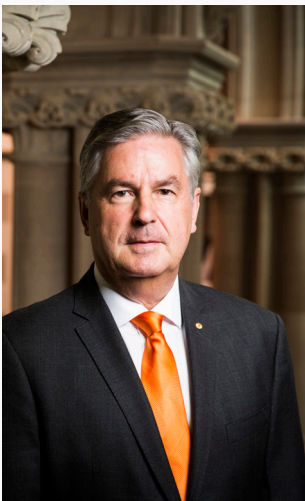
COMMISSIONER HON KEVIN SCARCE

Palula malangka Commission-er-ngku tjukurpa ara tjuta nguru mantjira tjungulku panya palula nguru wangkara kulintjaku.